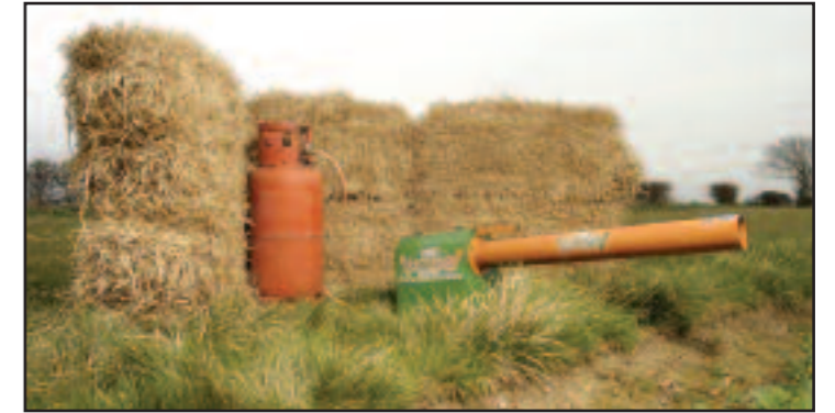
Auditory scarer with baffles