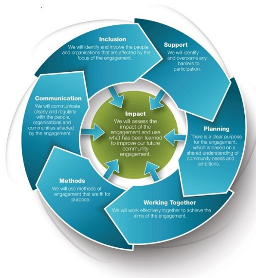
Figure 3 The National Standards for Community Engagement

As a key stakeholder in the process, we will also ensure that Community Councils are kept informed and involved at all stages of the preparation of the plan.