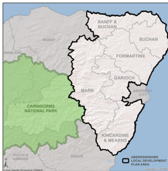
Figure 1 Area of effect of the Aberdeenshire Local Development Plan

The Local Development Plan covers the whole of Aberdeenshire, except that part within the Cairngorms National Park. They have their own Local Development Plan.