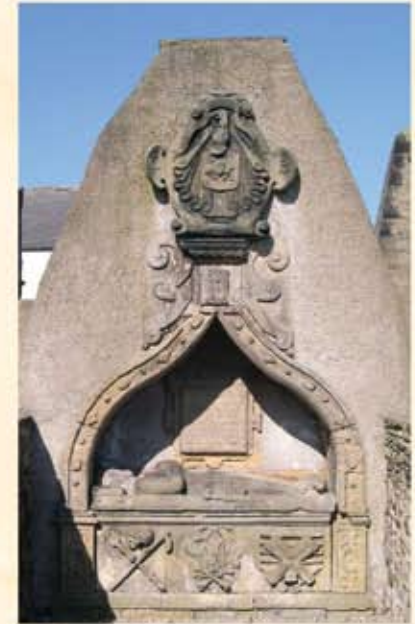
Bairds of Auchmeddan tomb

This great classical tomb, on the eastern boundary of the kirkyard, is an extravagant statement of belief in an afterlife and of the status of the family of the archbishop murdered by Covenanters near St Andrews in 1679. Dating from 1698, it is covered with symbols of death and resurrection. Below the elaborate flanking pilasters are a skull and sexton's tools, with a full skeleton between. The top, by contrast, carries winged figures bearing trumpets and the Book, symbolising triumph over death.