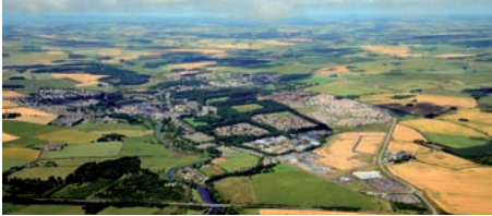
Ellon from the air