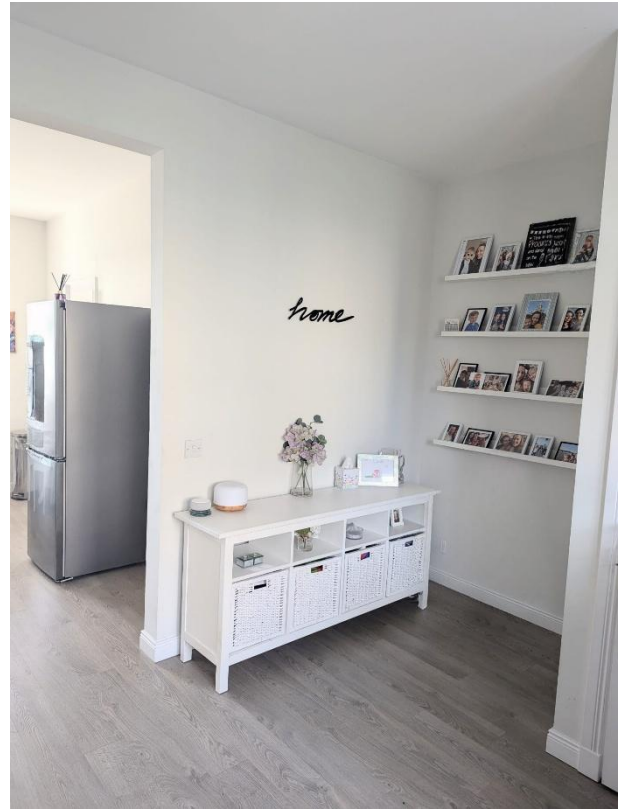
Alternative View of Living Room