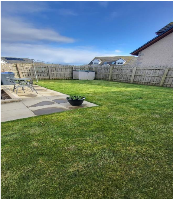
Alternative View of Back Garden